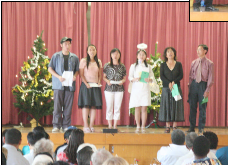
Top Left: Congregation and musicians