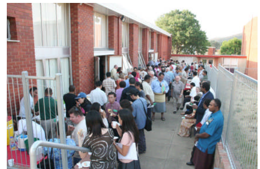
Top Left: Fijian Methodist Choir Top Right: The congregation Middle Left: Papua New Guinea Cultural Group Choir Middle Right: Philippino International Christian Group singer Bottom Left: O'Connor Tongan Choir Bottom Right: Refreshments

Canberra Christian Fellowship's Multicultural Christmas Carol service featured choirs and songs from six Asia-Pacific nations; a talented ensemble of musicians; five carols sung heartily by a large congregation and small gifts to the children present – all to celebrate the birth of our great God and Saviour, Jesus Christ.