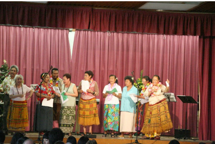
^ The PNG group