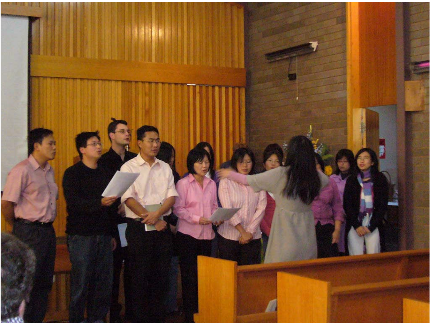
The Austral-Asian Choir