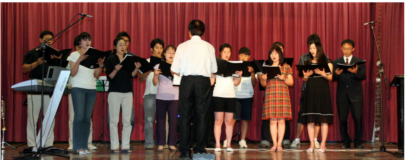
Above: The Reid Korean Church Choir