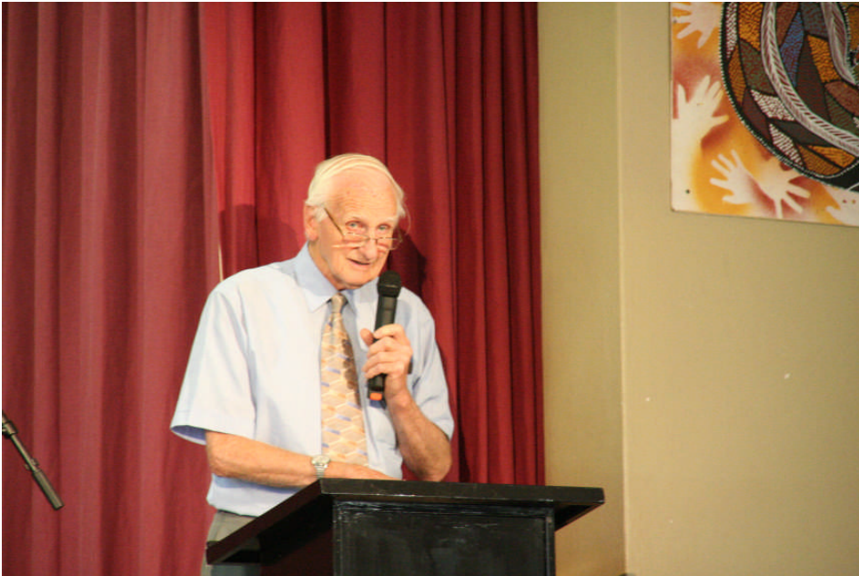
Left: The Welcome (Howard)