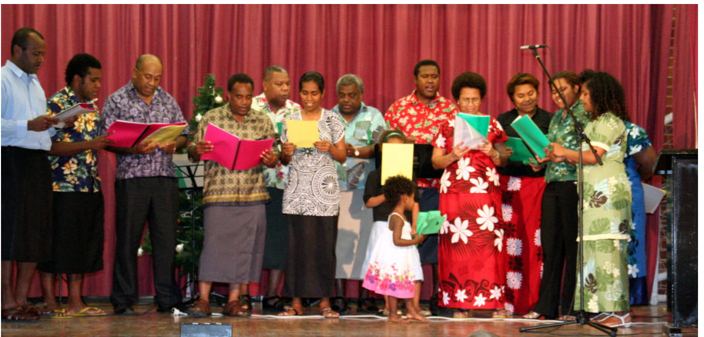
Below: The Fijian Methodist Choir