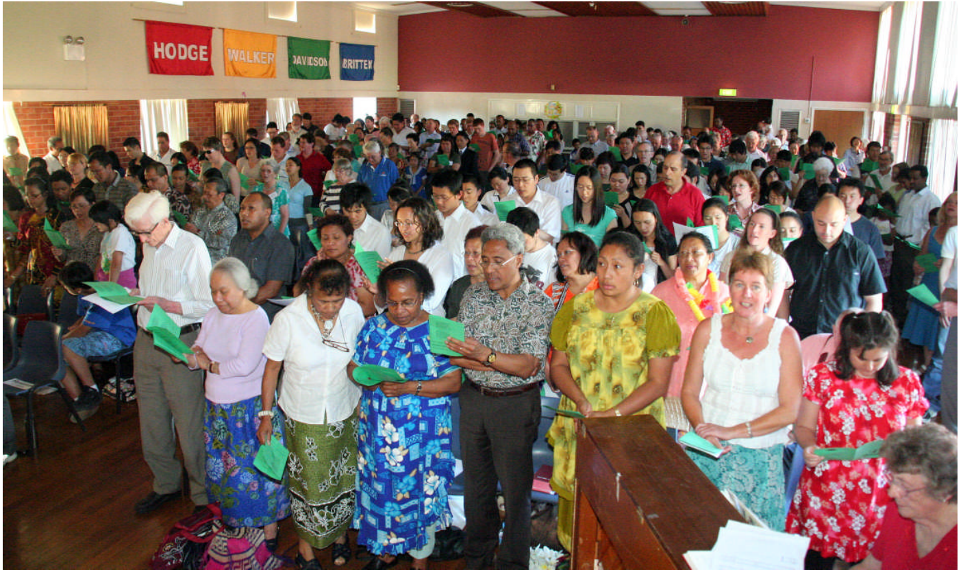
Above: The Congregation