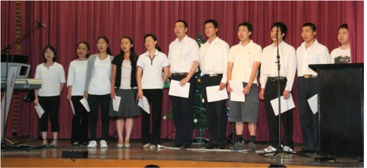
Above: The Chinese Methodist Choir