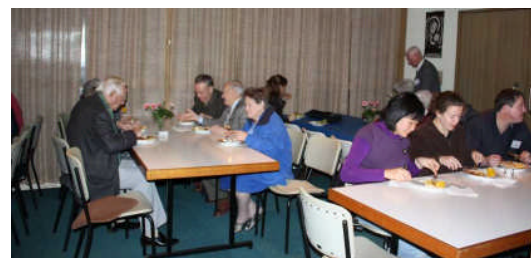
Our after service meals are normally good, but not this good!