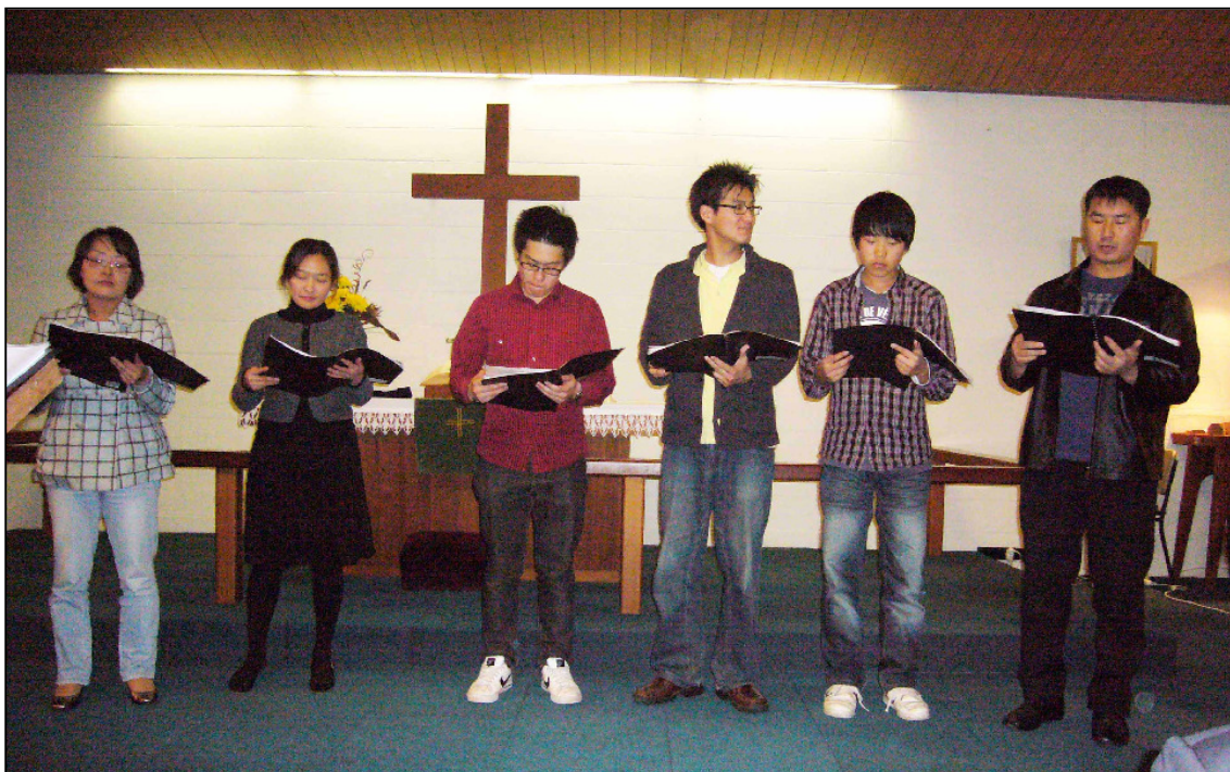
The Koreans sang for us during the service