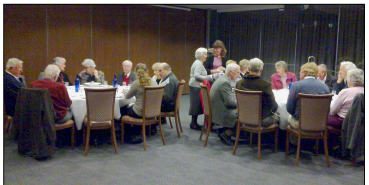
Chatting between courses