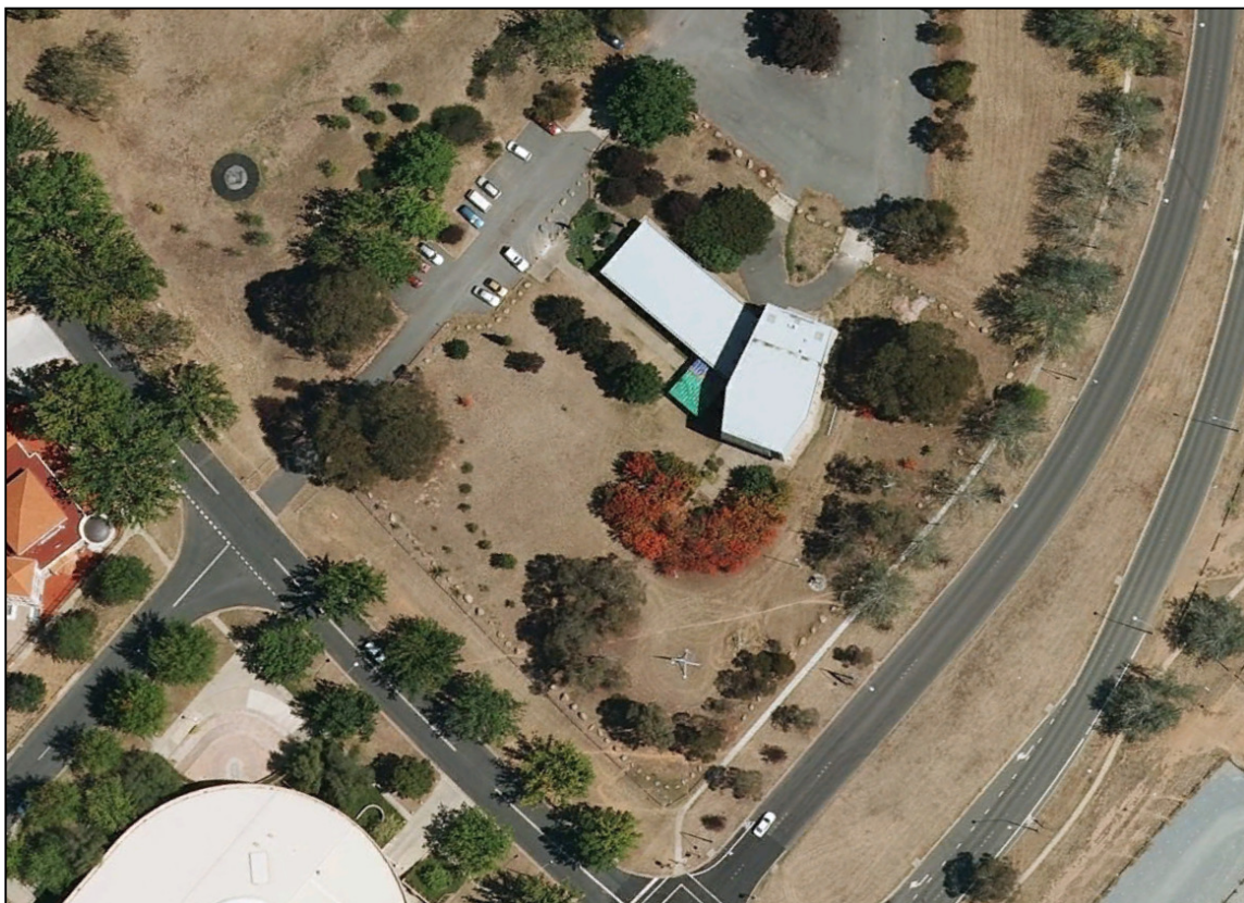
Google Earth's view of Canberra Jewish Centre / Synagogue