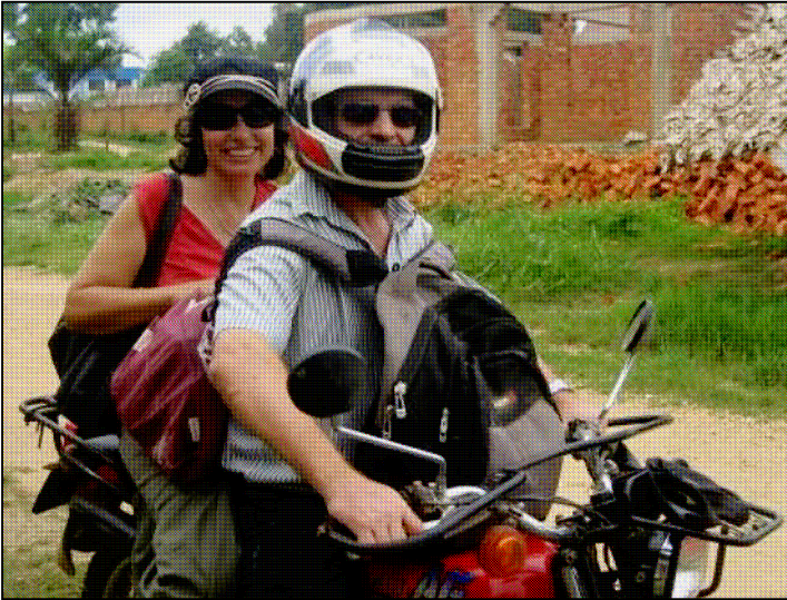
Coming home from a days teaching at Bible School