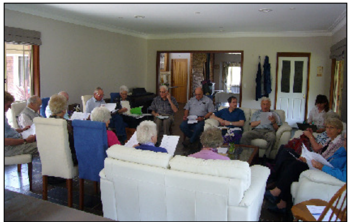
Above: Considering weighty matters.

Vince's masterpieces of culinary excellence, combined with several salads, corn cobs and jacket potatoes made for a delicious and filling first course. Sweets were equally up to