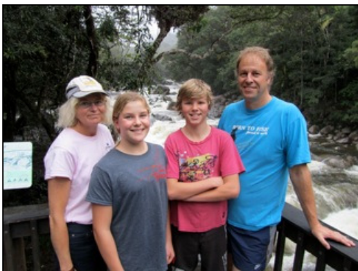
At Mossman Gorge