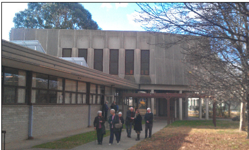
Left: Some of our group leaving the Jewish Centre at the conclusion of our visit

Among other things, we learned that this is the year 5771 in the Jewish calendar, there are 613 commandments that Jews should keep, Israel would fit in Tasmania six times and that Jews make up only 0.2% of the world's population.