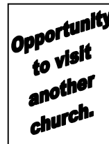
No CCF service. Most people away.