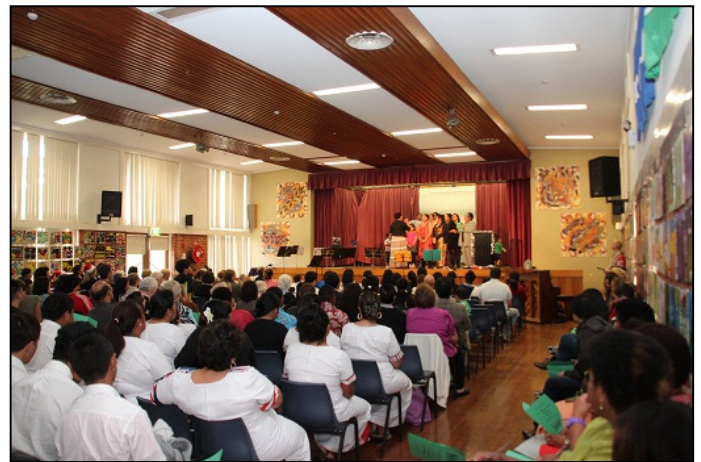
Congregation and Tongans