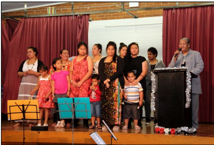
Tongan Wesleyan Methodists