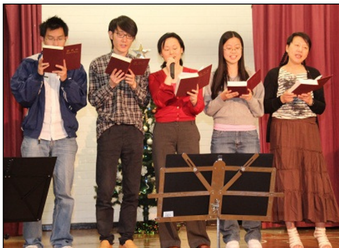
Right: Chinese Methodists