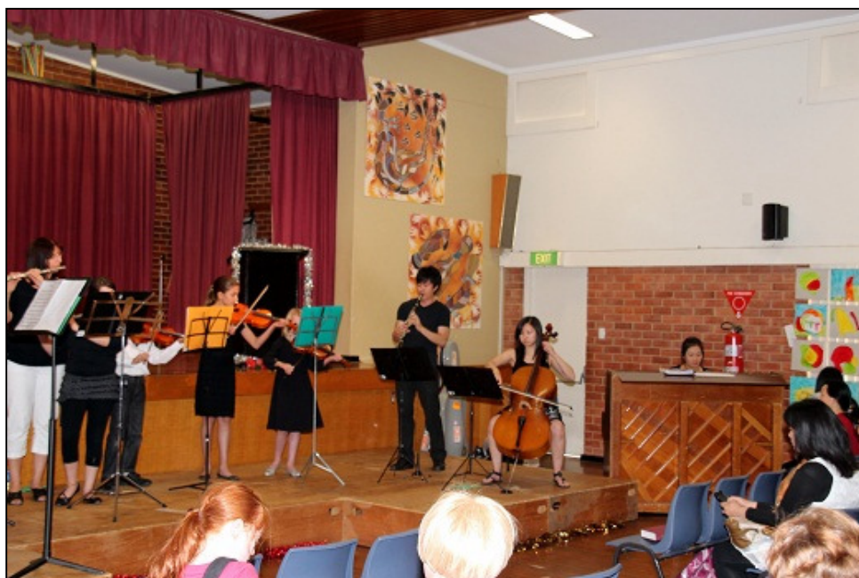
Our musicians playing before the Carols began