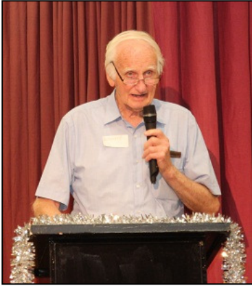
Left: Closing announcements