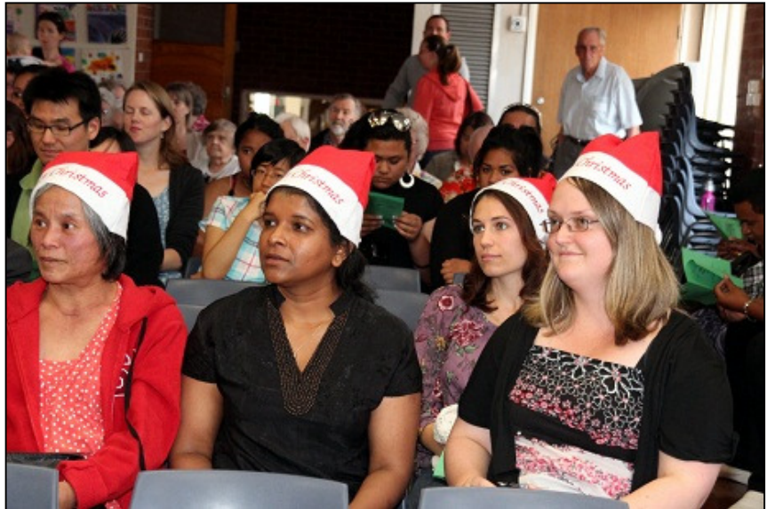
Right: In a Christmas mood