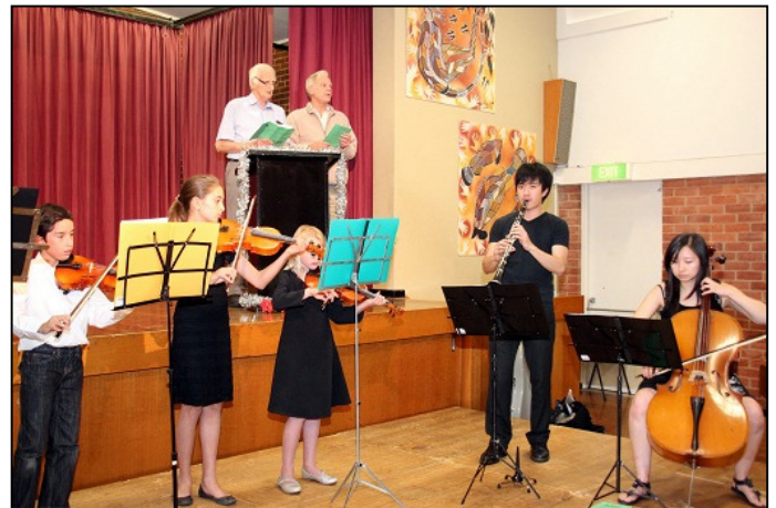
“O Come All Ye Faithful”