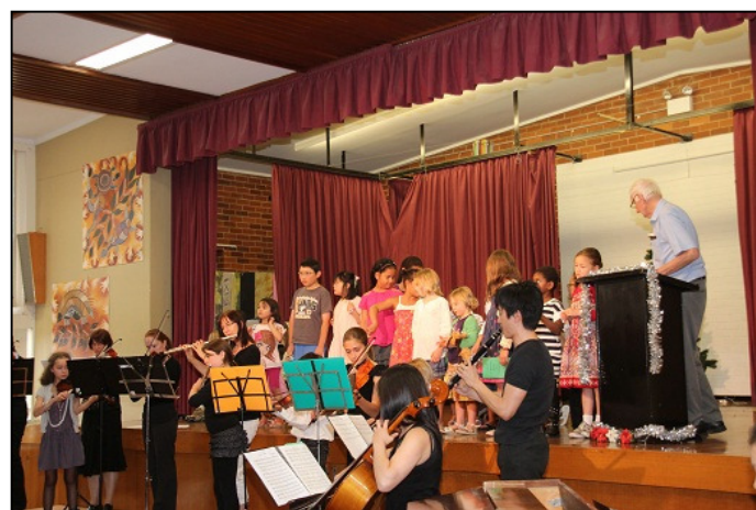
Children's segment / "Away In A Manger"