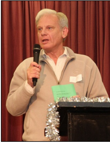
Introducing the Koreans