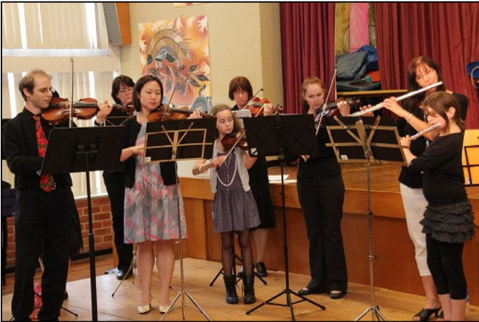
Below (4 pictures): Musicians playing while refreshments are brought out.