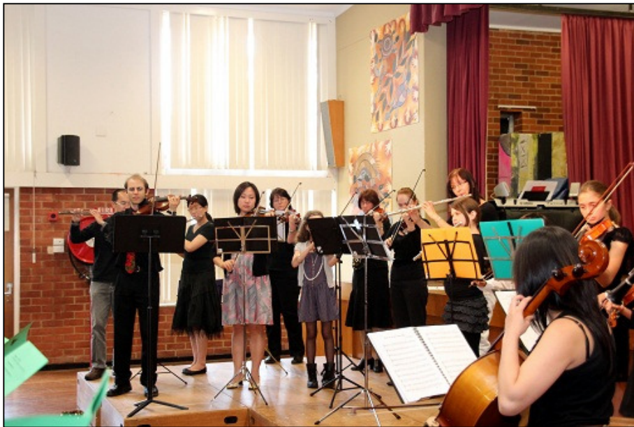
Musicians playing “Hark The Herald Angels Sing”