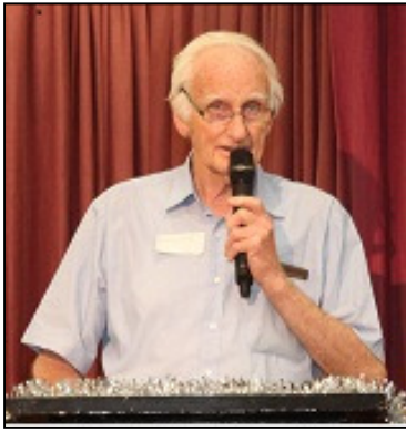
Above: Welcome !