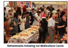
Refreshments following our Multicultural Carols