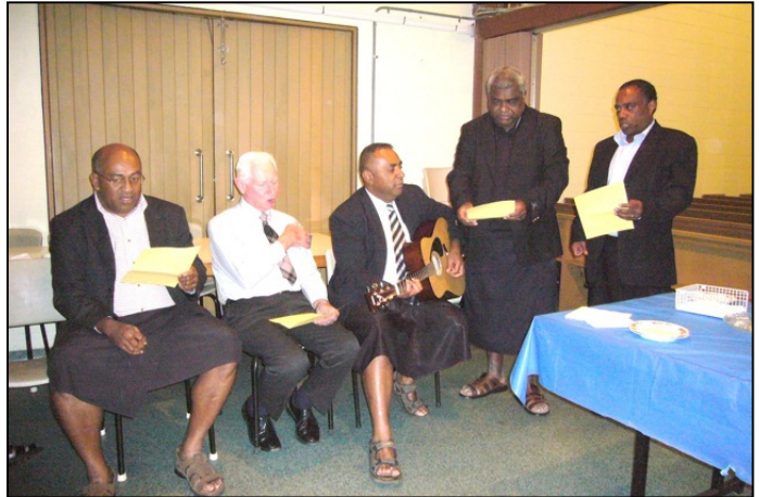
The Fijians sang for us at this service