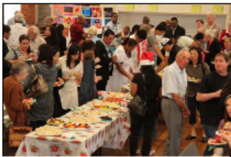
Refreshments following our Multicultural Carols

E-mail: canberra@yaho.com.au Website: http://www.canberracf.org.au/