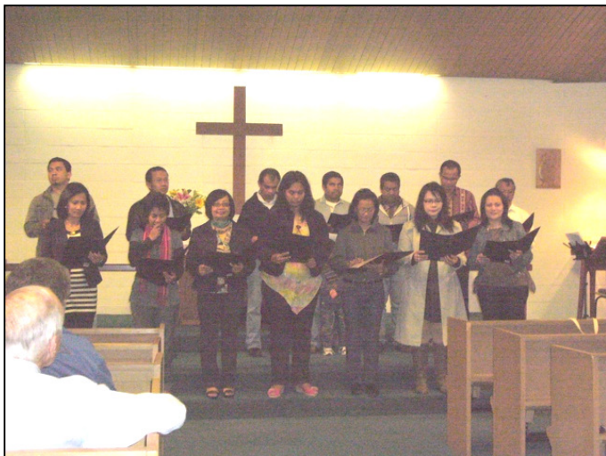
The Indonesian choir