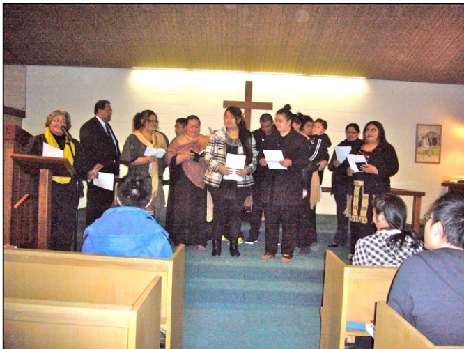
Tongan Wesleyan Methodists