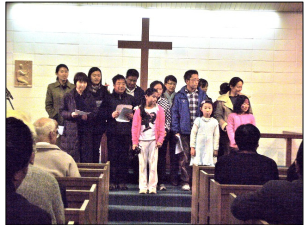
Above: Chinese Methodists Left: Indonesians Christians Below: Young Indonesian musicians