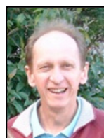
Rev. Owen Chadwick