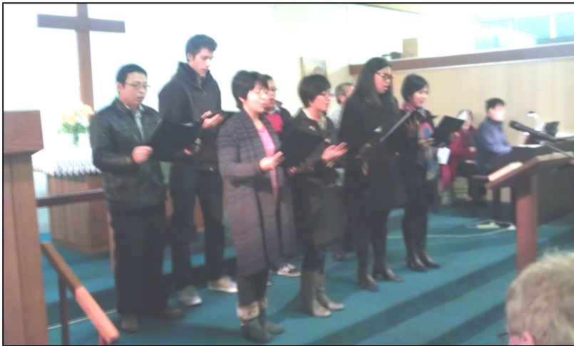
We were glad to welcome our Indonesian friends to our 23rd June service.