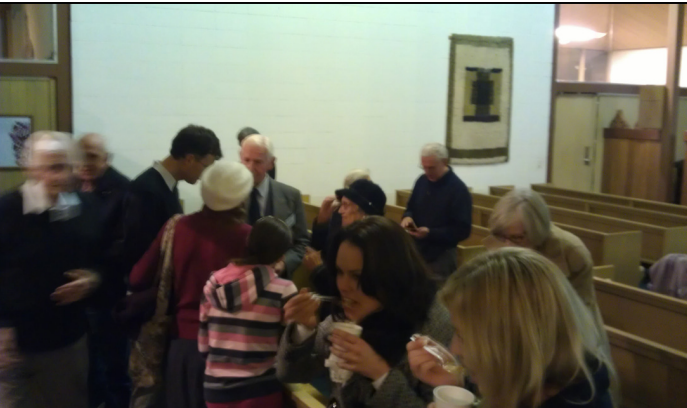
Sipping soup and chatting