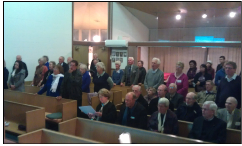
Above: Part of the congregation