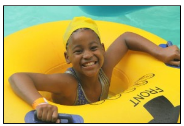
Visit to Splash Water World