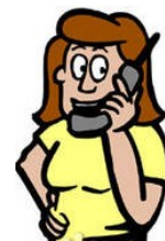
Fellowship by Phone