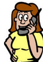
Fellowship by Phone