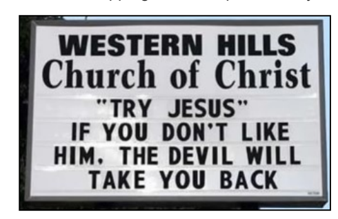
I HATE this church! - Satan