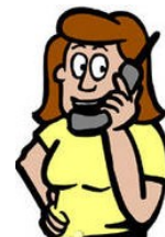
Fellowship by Phone