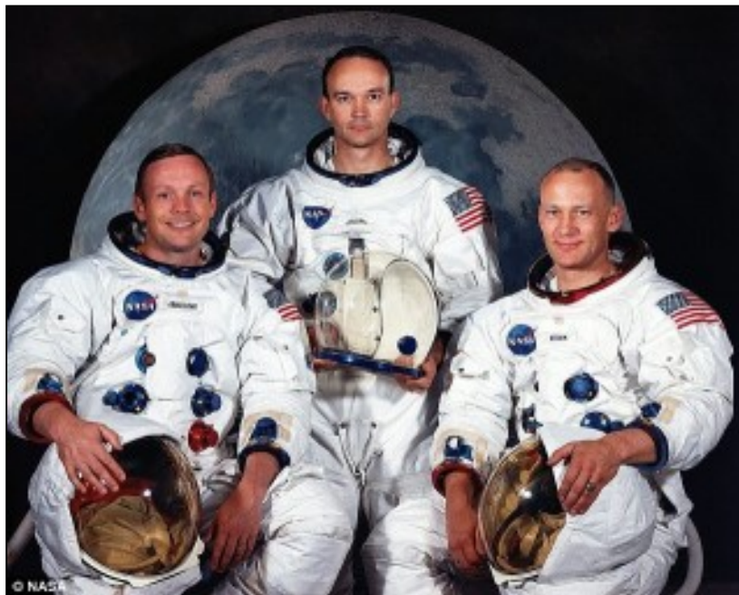
The Apollo XI crew, from left: Armstrong, Lunar Orbiter pilot Michael Collins, and Aldrin

"before they emerged from the "Eagle," the Lunar Lander, Armstrong's co-pilot Buzz Aldrin, pulled out a Bible, a small silver chalice, and some sacramental bread and wine. There on the moon, their first act was to pray and celebrate communion.