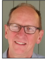
Mr. Owen Chadwick