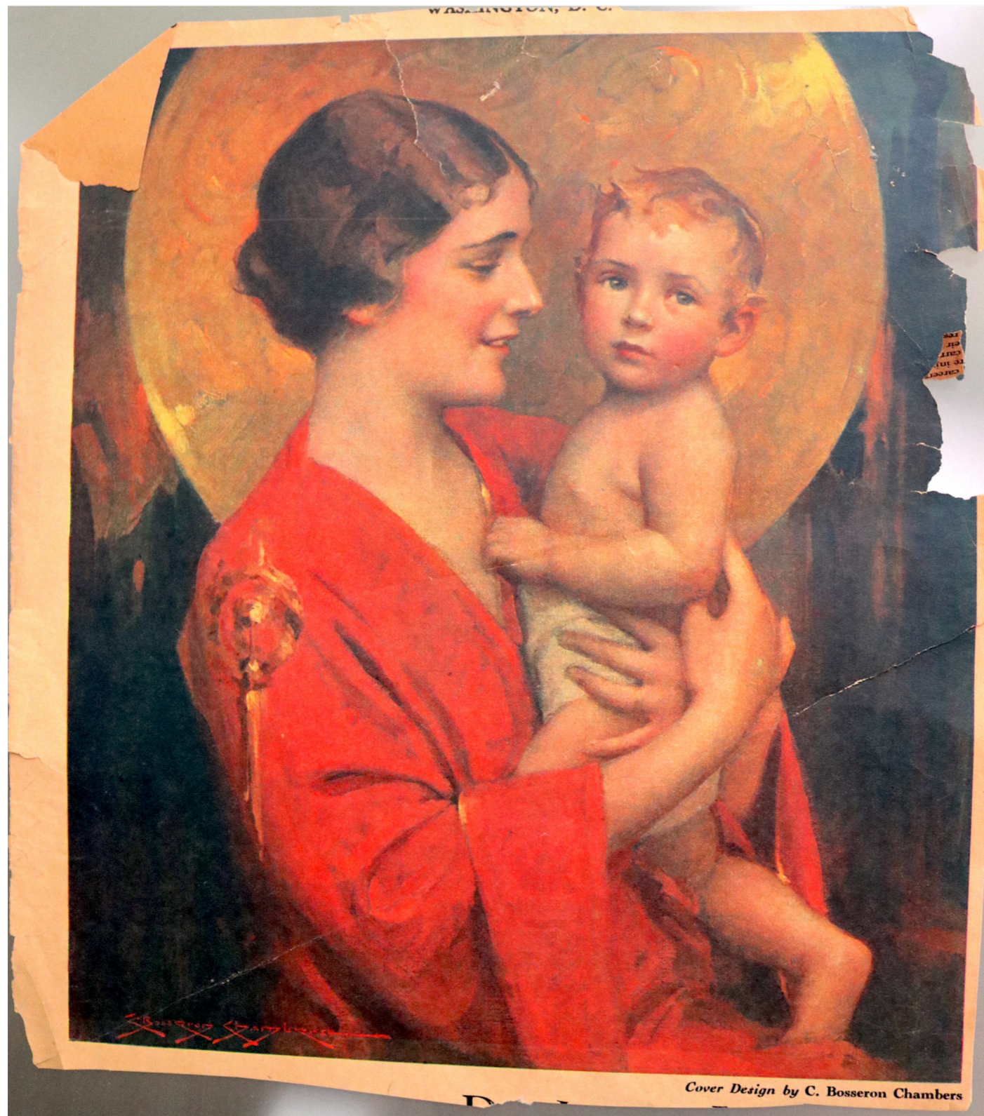
Cover Design by C. Bosseron Chambers