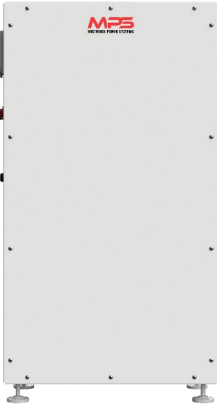
Figure 2 Front view of battery module