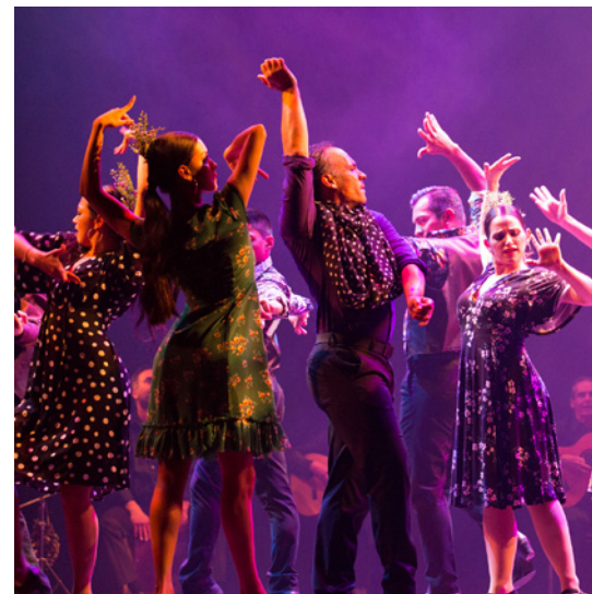
Harris Theater for Music and Dance, Chicago

"Wowed Audience" - "Amazing" The New York Times