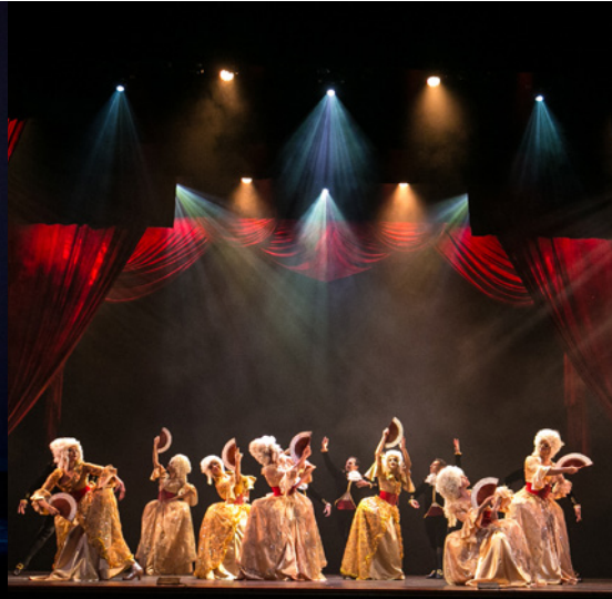
North Shore Center for the Performing Arts, Skokie