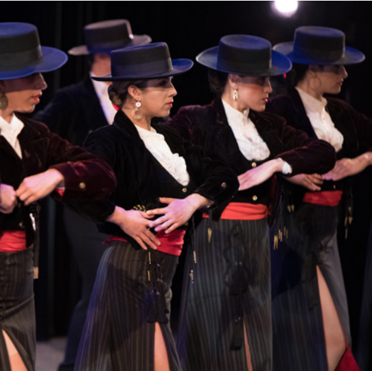
Northeastern Illinois University Auditorium, Chicago