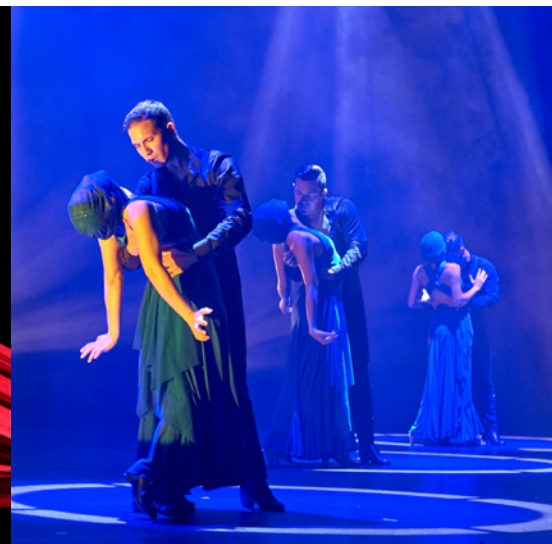
Blue Bell Auditorium, Pennsylvania