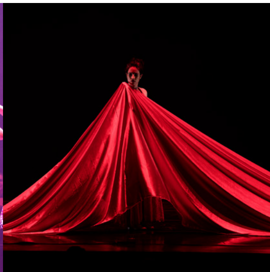
Touhill Center for the Performing Arts, St. Louis