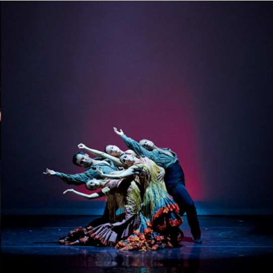
Auditorium Theatre, Chicago