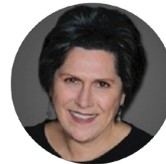
Gail Kalver Arts Management