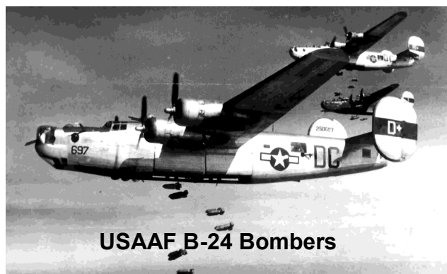
USAAF B-24 Bombers