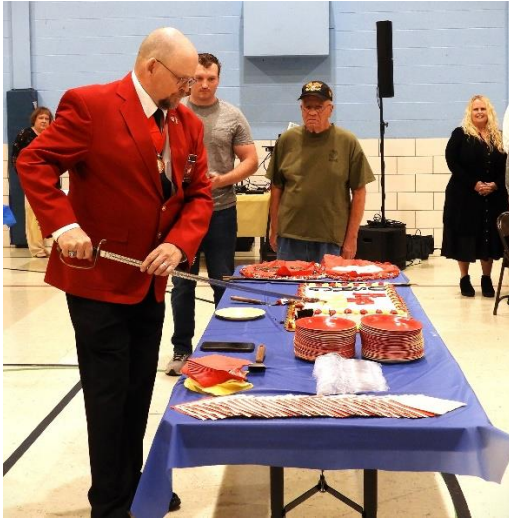
#502 Mounds Detachment

Here are photos submitted by Detachments of their 248 th Marine Corps Birthday celebration. Be sure to check out more photos on each Detachment's Facebook page or website.