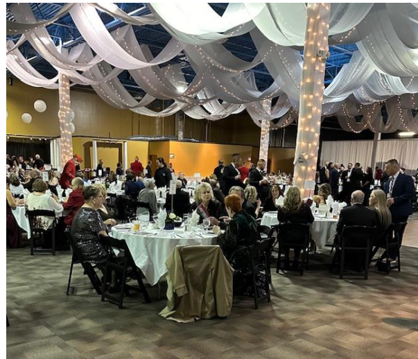
#1435 Pride and Purpose Detachment