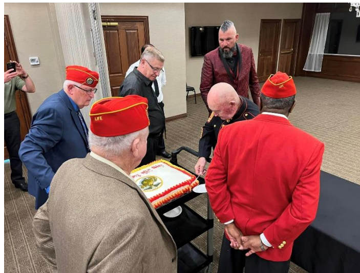
#844 Tripoli Detachment