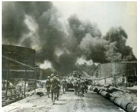
Burning oil refineries at Balikpapan

Despite the early capture of the airfields at Sepinggang and Manggar, it was not until 15 July that the first RAAF Spitfire fighters began operating, and ultimately the airfields could not be used for bombing operations. Additionally, much of the port area and oil producing facilities were heavily damaged by the pre-invasion bombardment and by Japanese sabotage efforts, rendering them useless to the Allies in the short term. Politically, the damage inflicted on