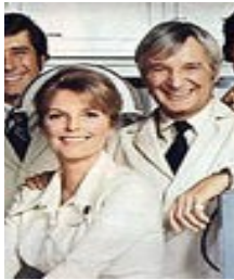
Julie London and Bobby Troup

credits include appearances on “Mannix”, “Perry Mason”, and “Adam-12” before becoming a regular on “Emergency.” Joining Troup on this show was his real-life wife Julie London—a singer in her own right with a hit song “Cry Me A River.”