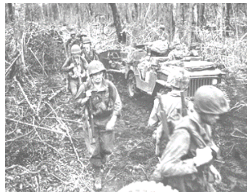
Time to rest in the tropics.