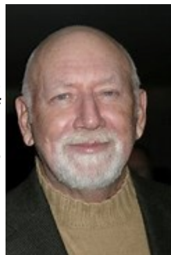
Donald P. Bellisario

They were all created or co-created by Marine Corps Veteran Donald P. Bellisario. Born in Pennsylvania in 1935, Donald joined the Corps in 1955. He left the Marines in '59, attaining the rank of sergeant. He graduated from Penn State University in '61, earning a degree in journalism. After spending 11 years in advertising, Donald moved to Hollywood to pursue his dream of screenwriting and production. During his time in the Corps, Don served with Lee Harvey Oswald