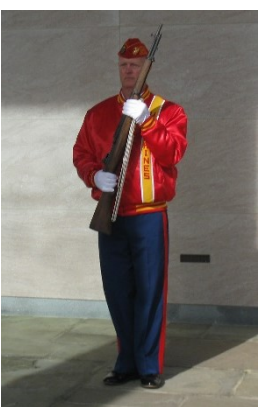
Present Arms – 2<sup>nd</sup> step