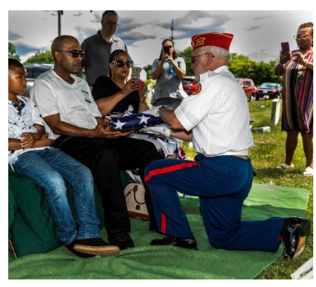
Presenting the Flag

Section 3420 <u>Presentation of the Flag</u>. Funeral honors ceremonies conducted by the Department of Defense use standardized language for the presentation of the flag to the designated flag recipient. The verbiage below will be used when presenting the U.S. flag during the funeral service.