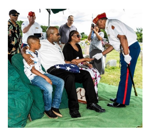
Presenting the Cartridges

(A) Three spent cartridge presentation. If a Firing Party is present and has rendered a 3-volley salute, after the flag presentation to Next of Kin has been completed, the Firing Party Commander may present the Next of Kin 3 spent cartridges. The Firing Party Commander presentation should include the following statement: "On behalf of the Marine Corps League's, (Detachment's Name) Honor Guard, we present you these three spent cartridges representing Duty, Honor, and Country, and thank you for allowing us to provide military honors for your loved one."