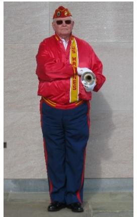
Up Bugle - count 1

Count 1 - The Bugler reaches across his/her body and grasps the bugle with their right hand.