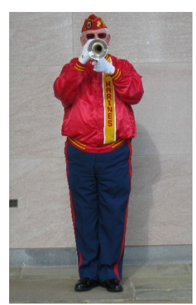
Up Bugle – count 3

• Count 3 – As left hand releases the bugle, the index figure pushes the Play button (optional), and the left arm is lowered to the position of attention. The Taps program will begin 5 seconds after the Play button is pushed.