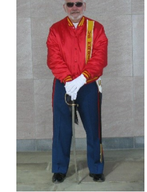
Ceremonial Parade Rest

MCO P5060.20, Chapter 5, Paragraph 5008 describes and shows the position of Parade Rest with the Marine Corps Sword. A modification to a Ceremonial Parade Rest is a posture identical to the position of Parade Rest with a Bugle, hands overlapping, left over right, and centered. After commanding a unit to Parade Rest, the Commander moves the left foot to the left, while rotating the blade of the sword down and to the left, so that the point of the blade touches the ground, and the left hand is brought to the right