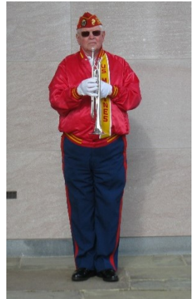
Up Buale - count 2

Count 2 – The bugle, held with both hands is moved to the center of the body while being raised through vertical (bell down) and rotated to embouchure with the bell forward and the bugle parallel with the deck. The Play button may be pushed while raising the Bugle (optional).