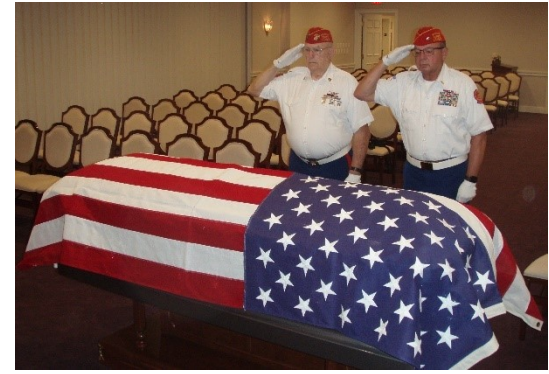
At the casket

Section 3400 <u>Flag Folding</u>. Folding the American flag is prescribed in MCO P10520.3B. See Chapter 6 – Attachment 1 for a detailed folding diagram.