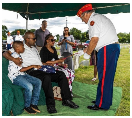
Presenting the Narrative

(B) Printed narrative presentation. If a Flag Folding Narrative has been given during the folding of the flag, after the flag and 3 spent cartridge presentations and to Next of Kin has been completed, the Narrator may present the Next of Kin the printed narration. The Narrator presentation should include the following statement: "On behalf of the Marine Corps League's, (Detachment's Name) Honor Guard, we present you the narrative of the folding of the American flag."