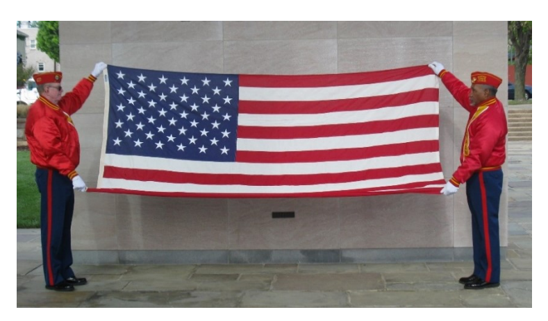
Displaying the Flag

Section 3410 Flag Folding Ceremony. The ceremony is initiated by a silent signal from the Anchor (member who will hold the hoist (Blue Field) end of the flag). The Anchor and the Folder move into position and ceremonially lift, tilt, and display the flag to the mourners. The Display of the Flag is the signal to the Firing Party for the three volleys. The Display of the Flag is maintained during the playing of Taps.