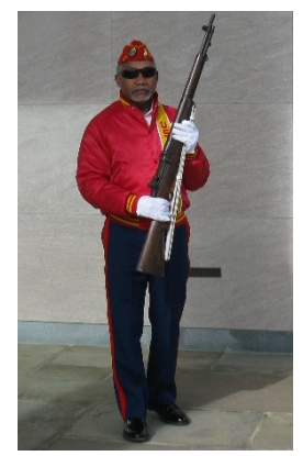
Present Arms - 1st step

PRESENT ARMS The riflemen execute a two-step movement of Left (or Right) Face (2 step movement) to face the front after firing of the volleys and executing Present Arms (1 step). The Firing Party remains at Present Arms during the rendition of Taps.