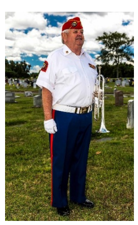
Bugle Down – count 2

The Hand Salute, while carrying a bugle, is rendered immediately after playing Taps and completing Bugle Down. The hand salute is also rendered upon the command of the Honor Guard Commander when a Bugler is in formation with elements of an Honor Guard.