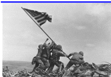
US Marines of the 28 th Regiment, 5 th Division, raise the American flag atop Mt. Suribachi on Feb. 23, 1945.

The Joe Rosenthal image is one of the most iconic pictures in the history of photographs. It has become a symbol of the Corps' dedication to the country and perseverance against all enemies in every place and time.