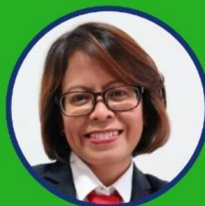
SN Jana R056223A