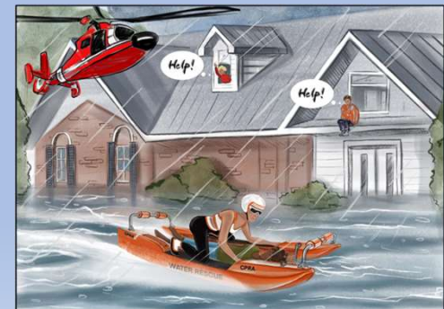
CPRA - A Community lifeline