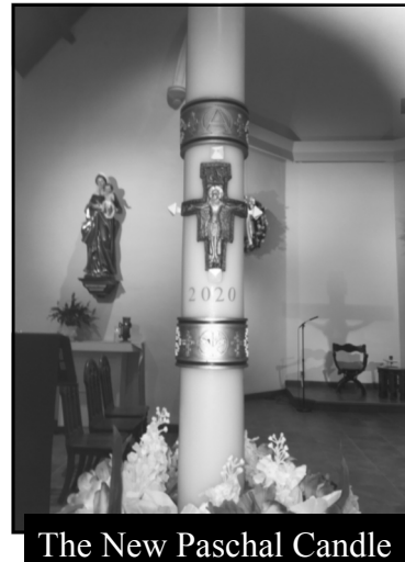
The New Paschal Candle