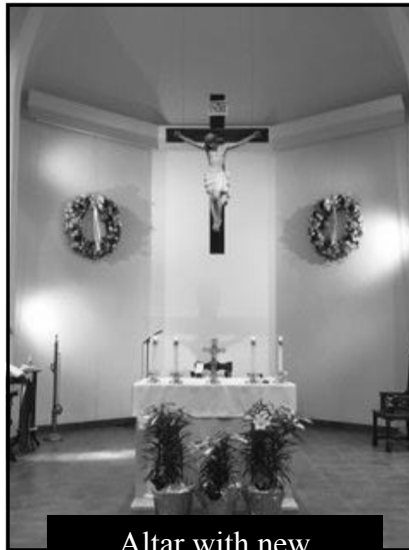
Altar with new Cross & Candles