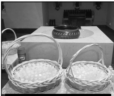
Prepping the Holy Water Bottles (Notice the Lysol!)