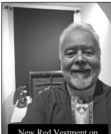
New Red Vestment on Good Friday