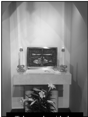
Tabernacle with the New Candles