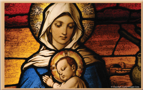
Mary kept all these things, reflecting on them in her heart. — Luke 2:19