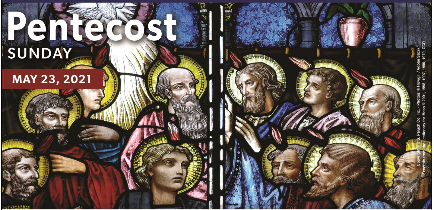
Copyright © J.S. Paluch Co. Inc. - Photos: © Hewgill/Adobe Stock Excerpts from the Lectionary for Mass © 2001, 1990, 1986, 1970, CCD.

Jesus breathed on them and said to them, "Receive the Holy Spirit. Whose sins you forgive are forgiven them, and whose sins you retain are retained."