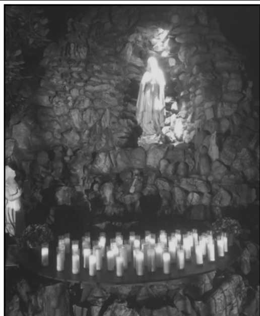
Our Lady of Lourdes Shrine Nov. 3, 2019

I call upon you, for you will answer me, O God. — Psalm 17:5