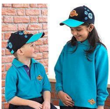
Beaver Scout Uniform

The team leader will let you know when your child is to be invested, so that you can purchase a uniform in readiness. The team leader will also advise you as to what parts of the uniform are mandatory and which are optional