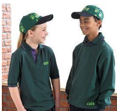
Cub Scout Uniform