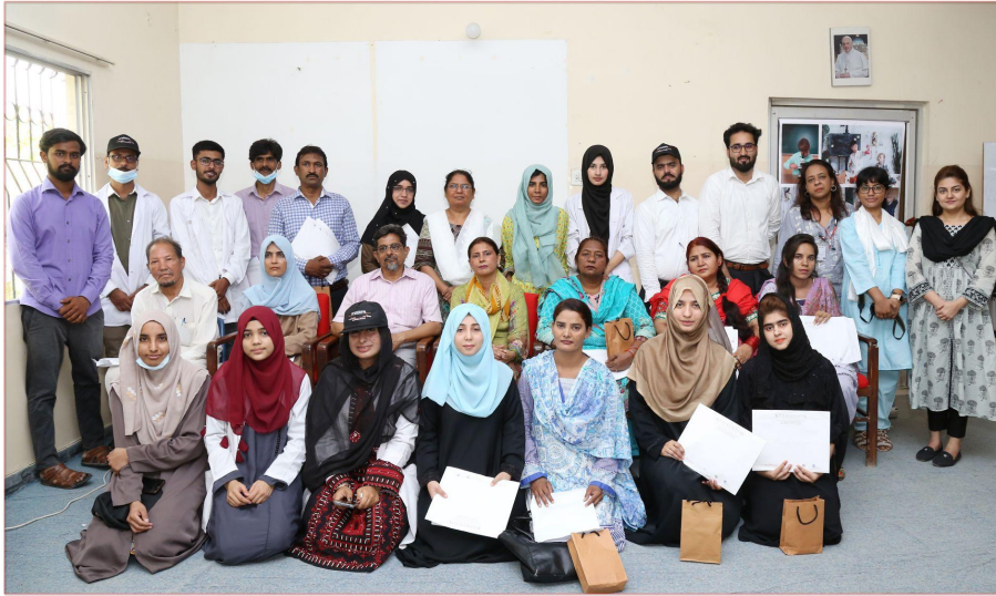
School Eye Health Program