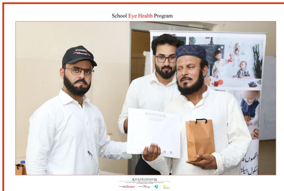
Teachers were awarded with certificates & gifts