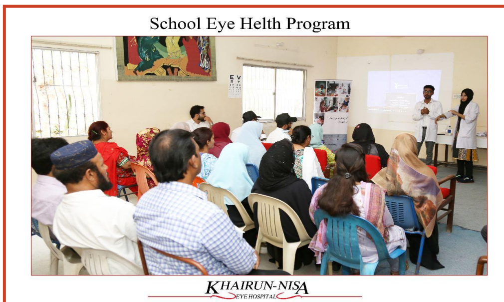
Teachers training for Eye screening

Students found with Non-Refractive conditions/common eye problems/unhealthy eyes are referred for Phase II.