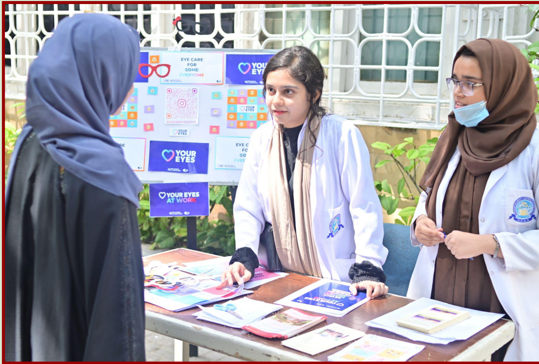
KEH arranged a stall to distribute educational and awareness material