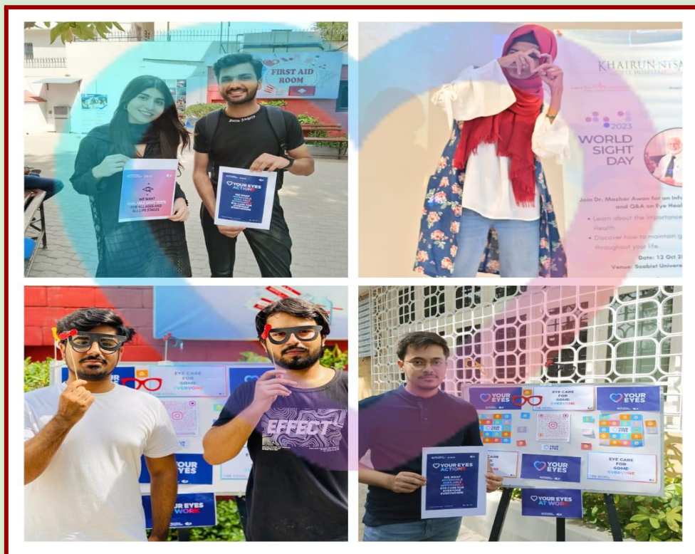
WSD theme glimpse