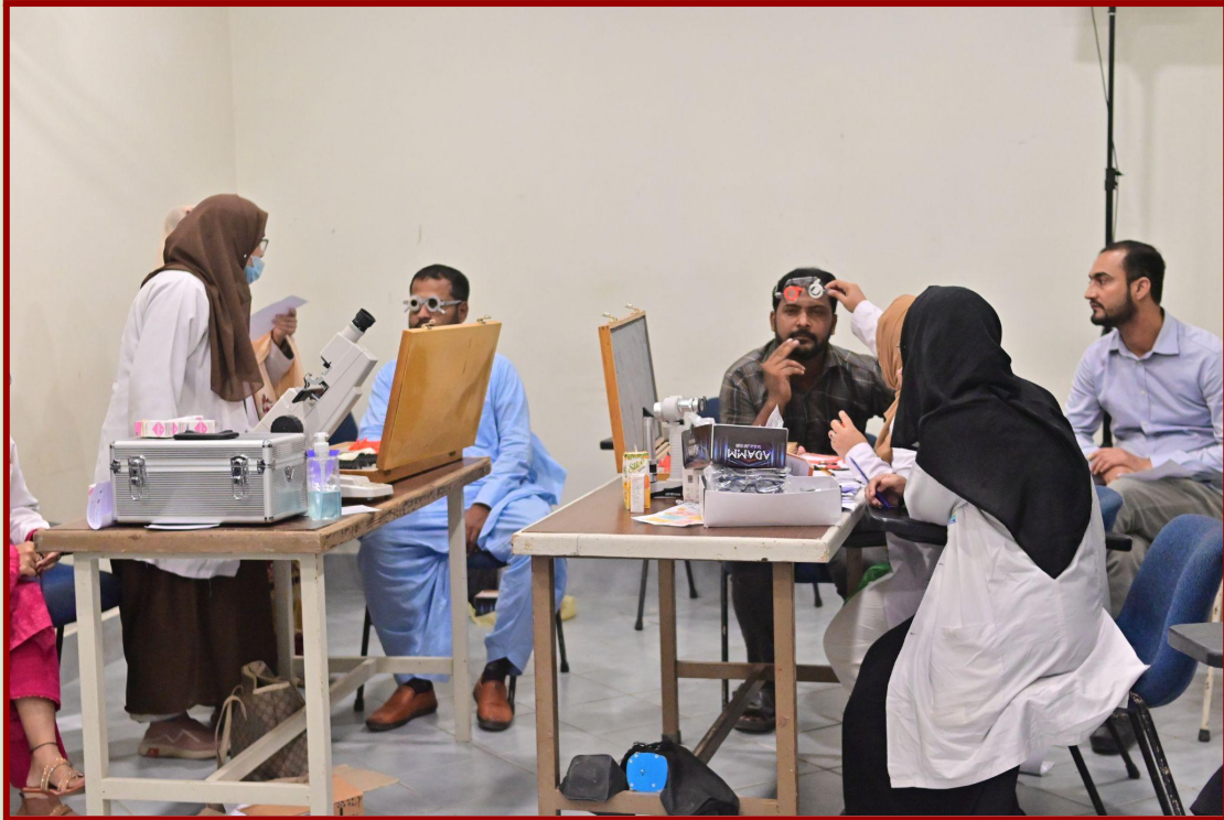
Our qualified Optometrist examining staff and students