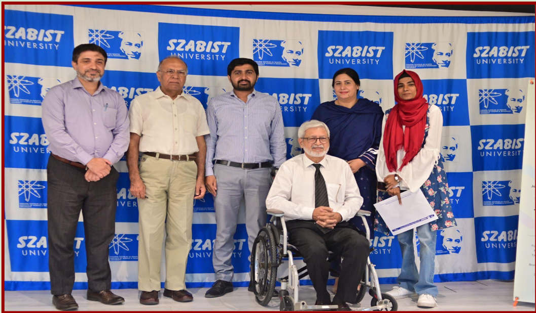
A group photo of Szabist and KEH team