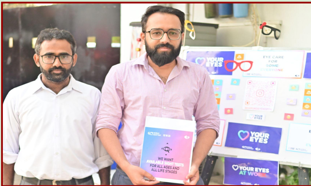
Employees demanding "We Want Available Sight Tests for all ages and all Life stages"