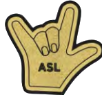
ASL-1 American Sign Language