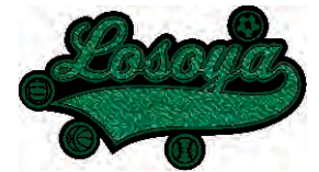
Script Straight w/Tail & Sport Decor

*Decor Options Available for All Activities and Sports