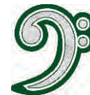
CLEF-2 Bass Clef