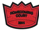
HOME-1 Homecoming Crown