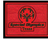
OLYM-2 Special Olympics Rectangle