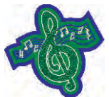
CLEF-3 Treble Clef w/Notes