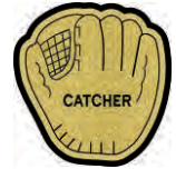
BASE-6 Baseball Glove