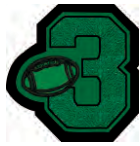
Single Digit w/Sport Insert