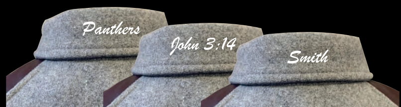
Script Name On Collar