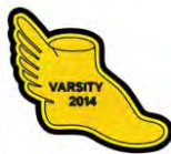
TRACK-1 Winged Foot