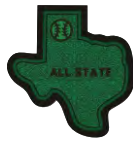
Texas w/Insert (more activities available)