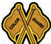
DRILL-3 Color Guard Crossed Flags