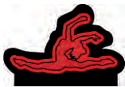
DANCE-3 Jumping Dancer