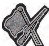
DRILL-4 Color Guard Flags and Rifle