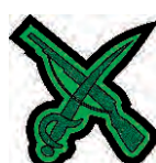
DRILL-6 Saber and Rifle