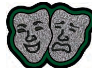
DRAMA-1 Drama Masks