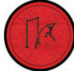
TRACK-2 Pole Vault