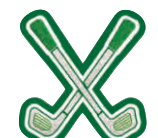
GOLF-2 Crossed clubs