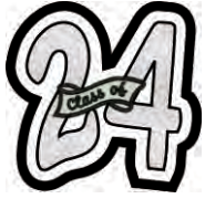
GRAD-1 2 Digit Crazy