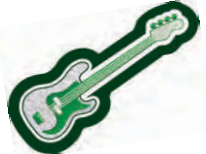
BAND-23 Electric Guitar