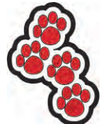
PAW-2 Walking paws