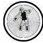
TRACK-3 Male Discus TRACK-5 Female