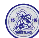
WREST-4 Wrestling Circle (Male)