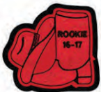
DRILL-2 Line Boot with Hat