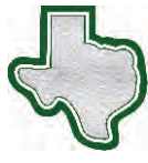
STATE-1 Texas Patch no insert