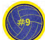
WATER-1 Water Polo