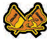
DRILL-7 Flags and Dancer