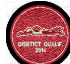
SWIM-4 Circle Swimmer (Female)