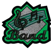
BAND-27 Band w/Notes over Diamond