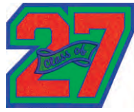
GRAD-2 2 Digit Block