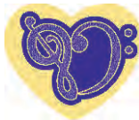
CLEF-5 Treble Bass Clef Heart