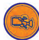
JOUR-5 Circle w/ video camera