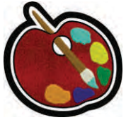
ART-1 Art Palette