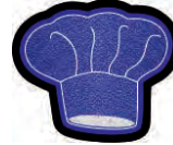
COOK-1 Chef's Hat