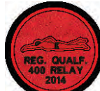
SWIM-3 Circle Swimmer (Male)