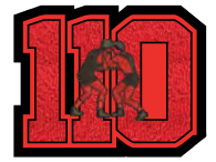
Three Digit w/Sport Insert