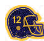
FOOT-2 Football Helmet