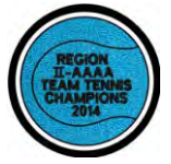
TENN-2 Tennis Ball