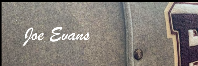
Script Name On Front