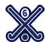
FHOCK-1 Field Hockey