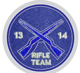
ROTC-6 Circle W/Rifles