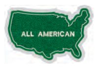
USA-1 United States