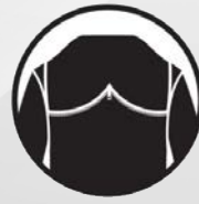
ZIPPERED HOOD BACK