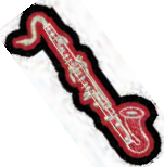
BAND-17 Bass Clarinet