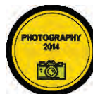
JOUR-4 Circle w/ camera