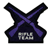
ROTC-4 Crossed Rifles