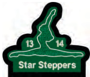
DANCE-2 Dance Patch