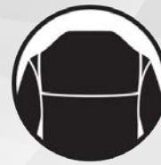
SAILOR COLLAR BACK