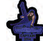
GYM-2 Pommel Horse