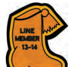
DRILL-1 Line Boot