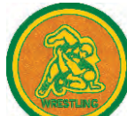
WREST-2 Wrestling Circle (Female)