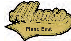
Script Straight with Tail