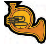
BAND-13 French Horn