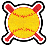
SOFT-2 Softball over Bats