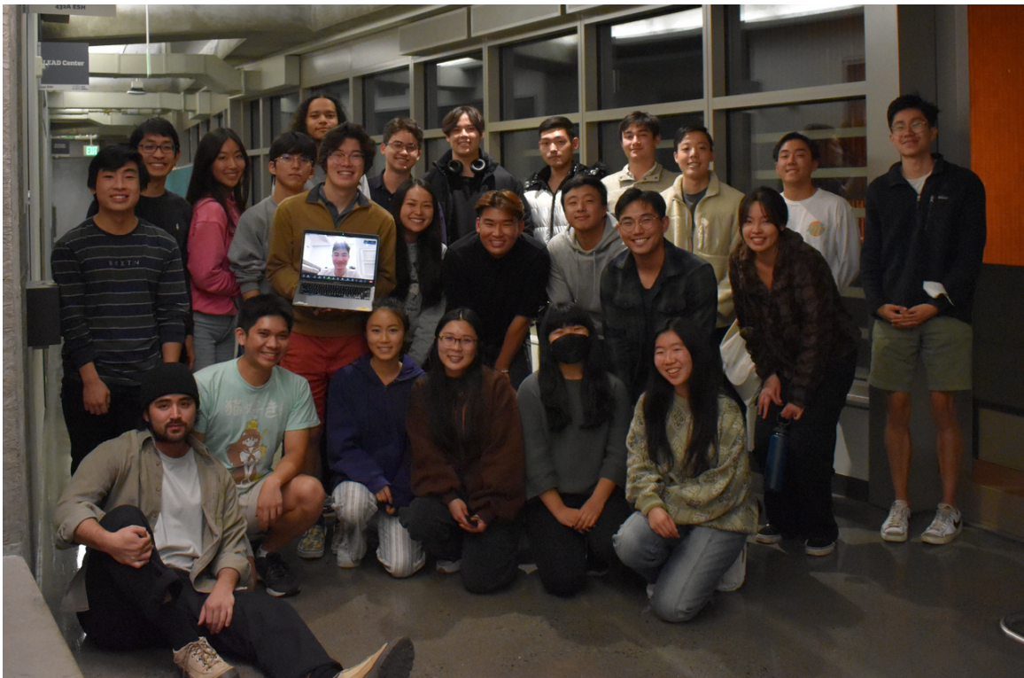
Nikkei Student Union Core officers