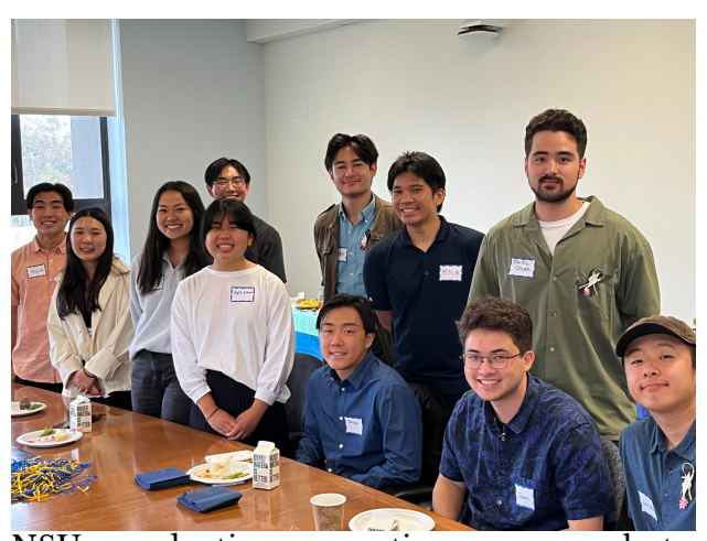
NSU graduation reception group photo