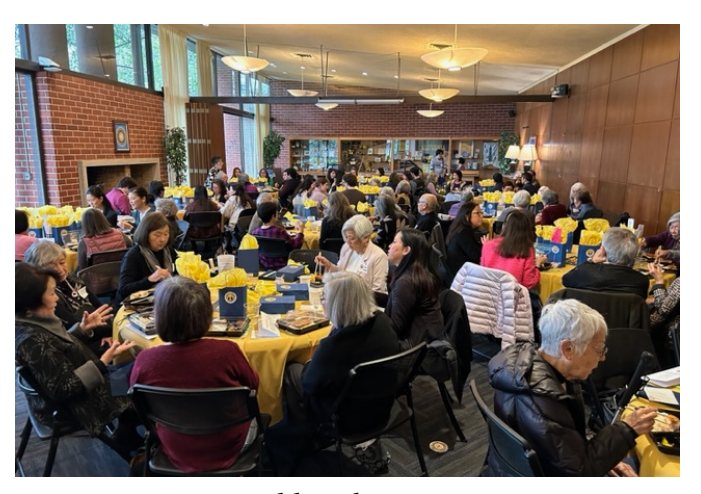
Annual luncheon guests