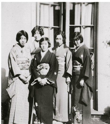
Japanese Women's Student Club Benefit Tea Fund-Raiser; U.C.Y.W.C.A., March 7,8, 1930

In three years, they raised about $2,000, which became the nucleus for the fund that enabled the Japanese Women's Student Club to purchase the former Filipino Student Clubhouse on 2509 Hearst Avenue. 36