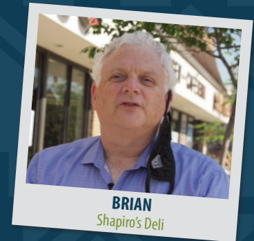
BRIAN Shapiro's Deli