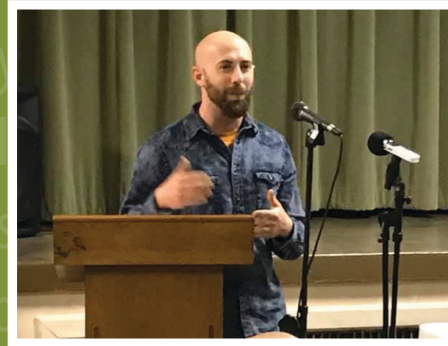
Your State Rep

"I was born and raised in Greater Indianapolis and have lived here my entire life, including as a renter downtown after graduating from Butler University. Indy is home and that feels good to say."