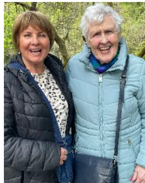
What a good day