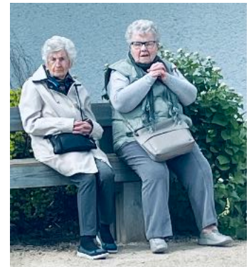
Resting after the tour