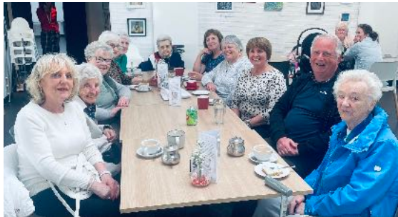
Eagerly waiting for lunch to be served