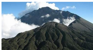
1. Mt. Meru, Tanzania