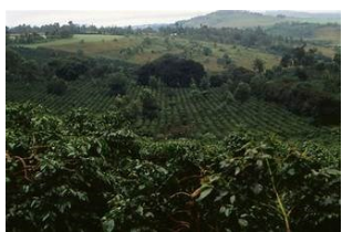
2. Coffee fields at Mt. Meru