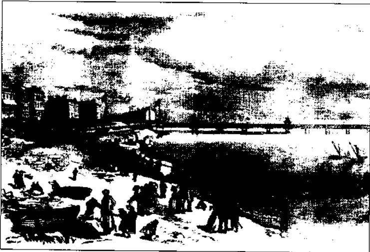
The seaside at Eastbourne