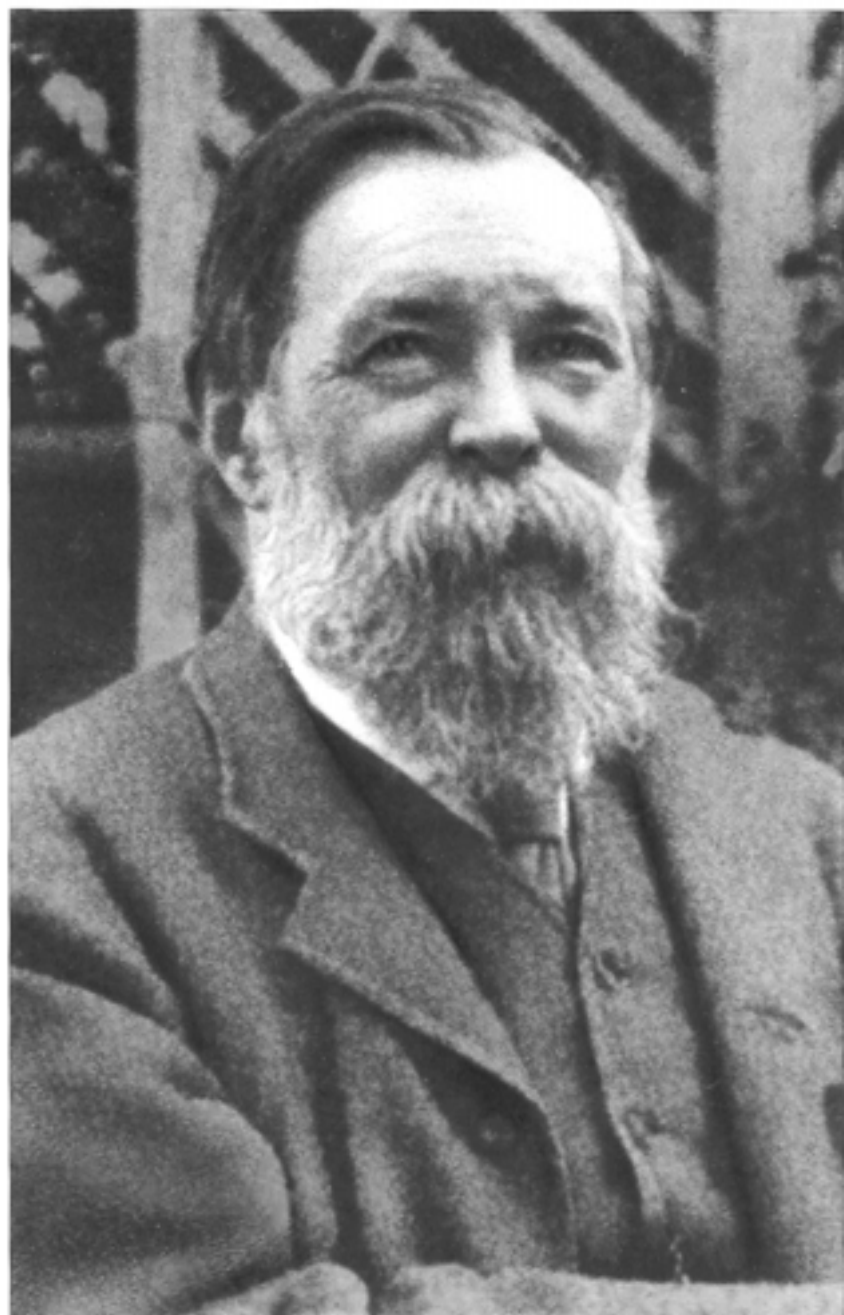
Frederick Engels, 1893