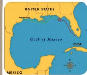
War comes to our shore... The Apalachicola Times