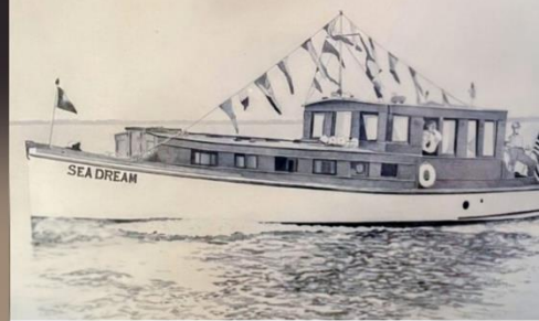
War comes to our shores | The Apalachicola Times The Apalachicola Times